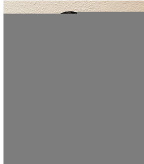
Happy Birthday Juan C. from Lompoc!

A very Happy Birthday to our amazing March volunteers! Your dedication and kindness brighten lives every day—thank you for all that you do!